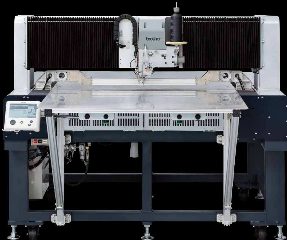
•Vertical Shaft Rotary Hook