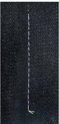
S-7180A Beautiful mode