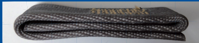
six-ply sewing for seatbelt

The use of the advanced controlled, heavy duty feed mechanism provides excellent, superb stitch quality and tight stitching even for extra-heavy sewing applications. Also, the upper thread feeding device which supplies the necessary length of upper thread at the start of sewing, preventing the thread from pulling-out regardless of the material feeding amount.